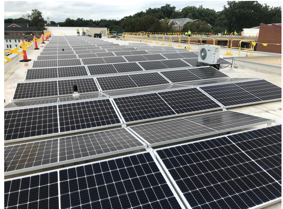
Solar installation at Abrams Hall